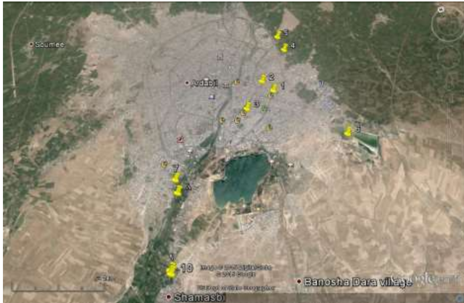
Figure 1 satellite image study vegetable gardens position Ardabil